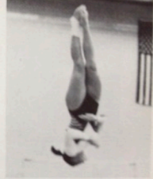
Top left: Preparing for a tumble.